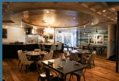
Full Buyout 259 seated