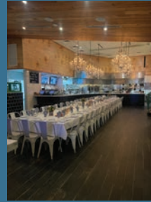
Full Buyout 190 standing | 200 seated