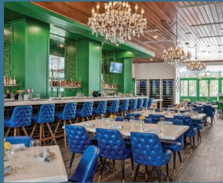
Full Buyout 280 standing | 260 seated