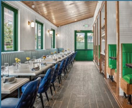
Oysterette Room 40 standing | 32 seated