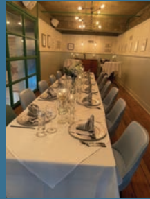
Loft 32 standing | 24 seated