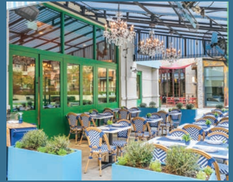
Patio 65 standing | 55 seated