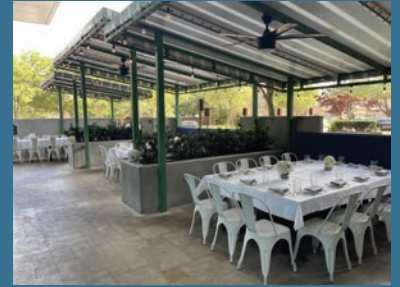
Patio 50 standing | 60 seated