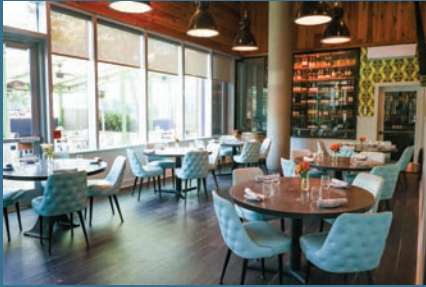
Wine Room 35 standing | 32 seated