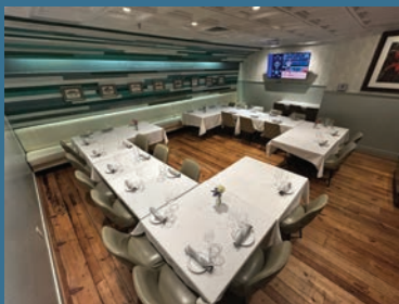
Wine Room 55 standing | 48 seated